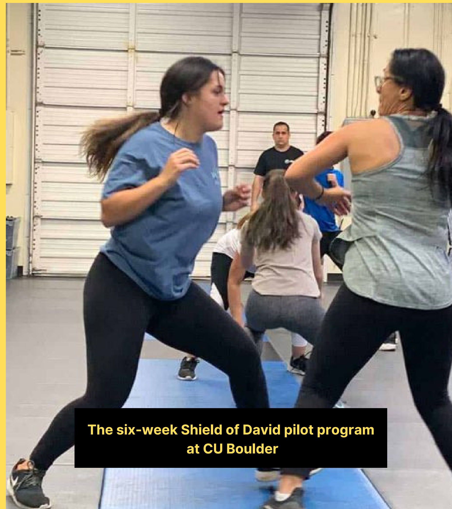
The six-week Shield of David pilot program at CU Boulder

Shield of David is a 501(c)3 Tax ID 85-2217082